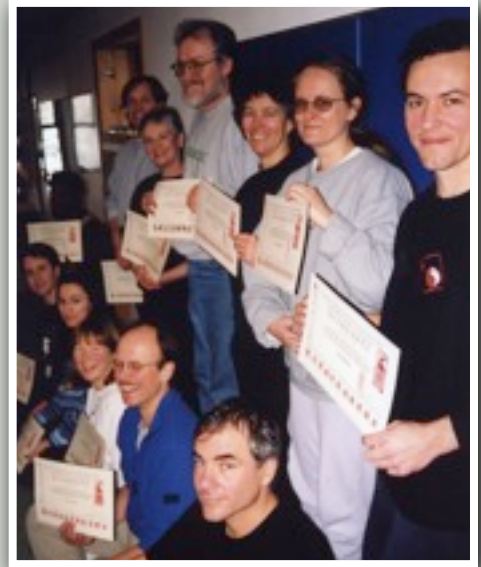
Three month Yang Intensive grads with certificates (Feb. 2002)